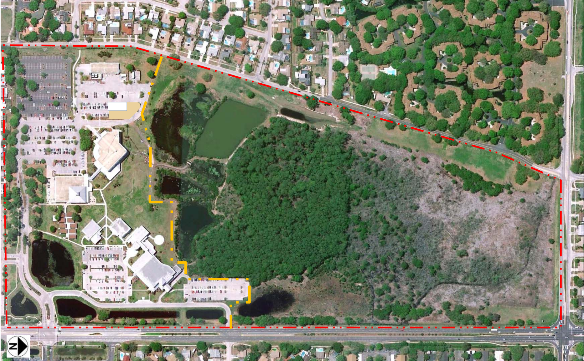
— — — — — Wetland limit area